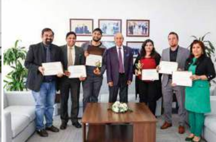
Highlight from the annual READ Iftar gathering